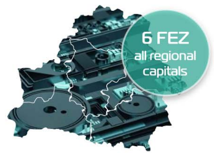
FREE ECONOMIC ZONES