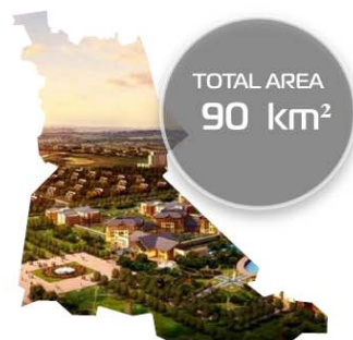
INDUSTRIAL PARK «GREAT STONE»